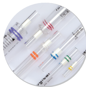
Ring mark: Yellow/Green/Blue/Orange/Red/Purple