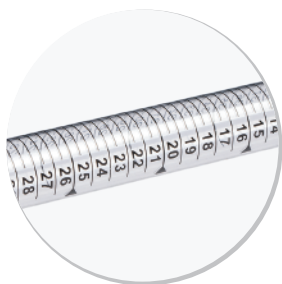
Graduation mark: Black